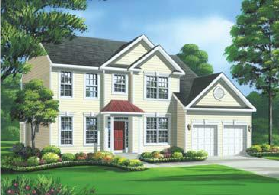
Exterior Elevations are Designed to your Specifications. Please see the Sales Team for Options and Pricing.